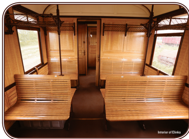
Interior of Elinka

The organizers reserve the right to change the programme.