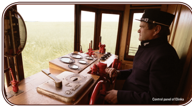
Control panel of Elinka